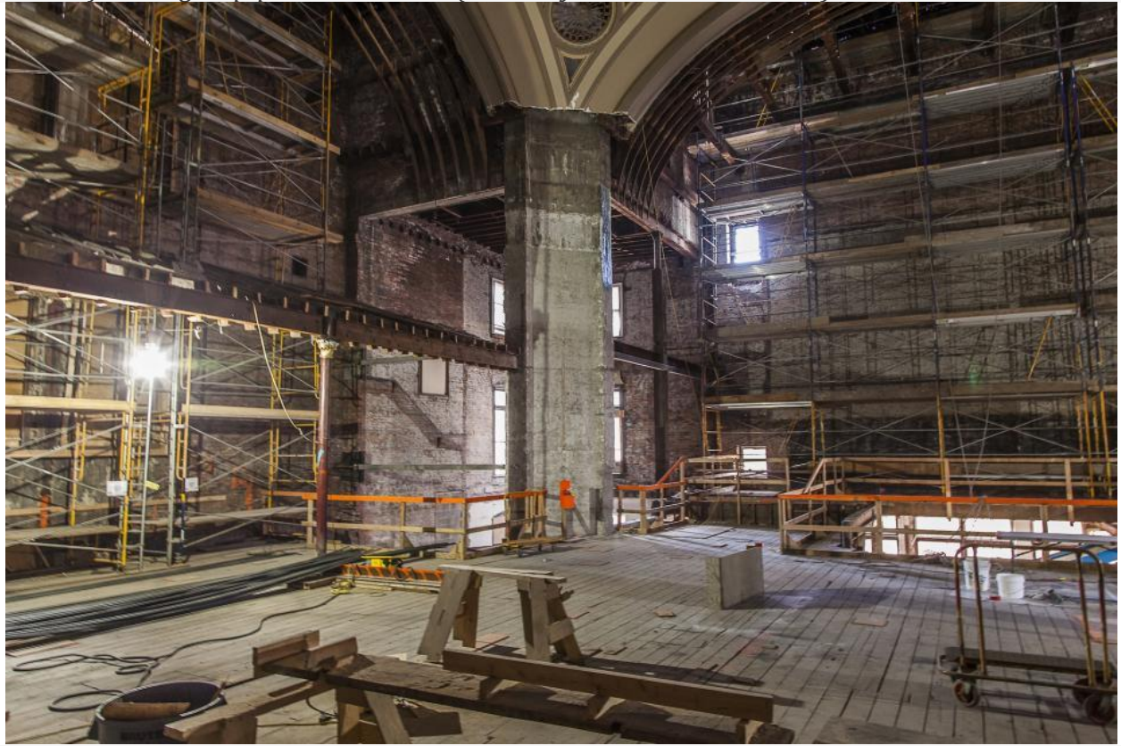
Restoration of the old church faced significant challenges, including earthquake proofing. (Photo by Daniels Real Estate)

Some of the organ pipes were saved. (Photo by Daniels Real Estate)