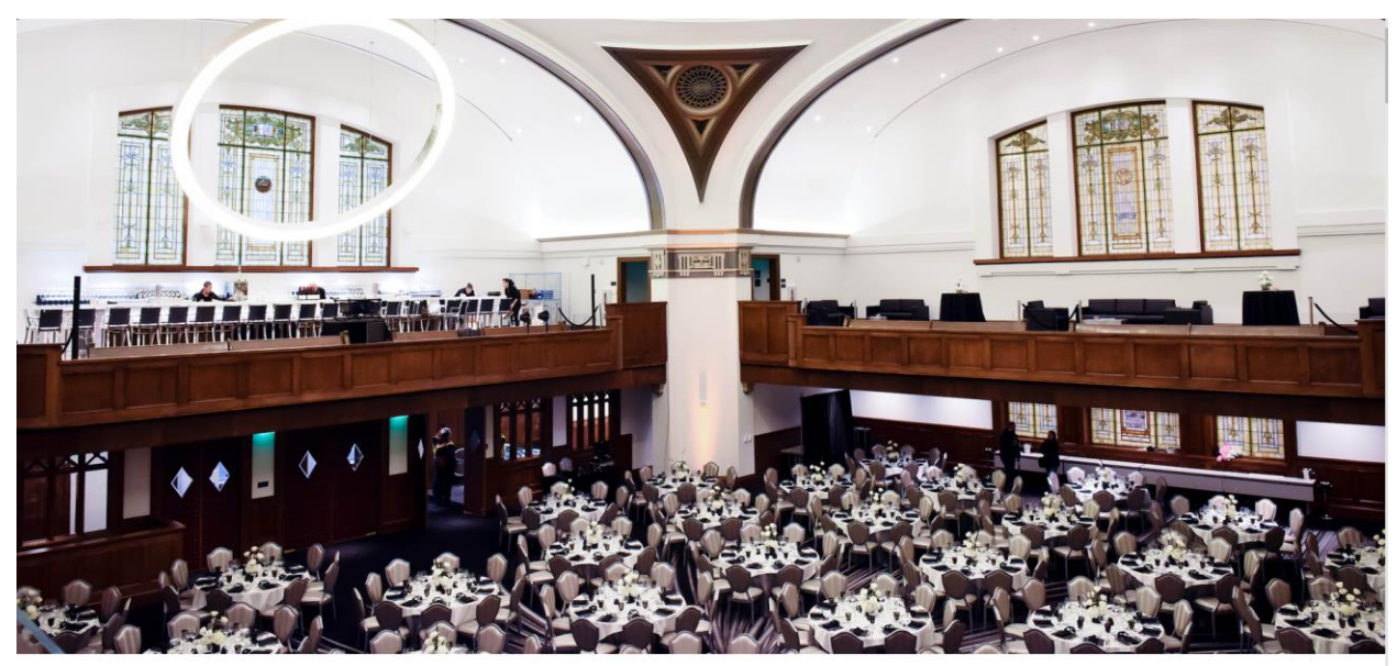
The Sanctuary in the old First United Methodist Church can be set up for a gala event. A bar overlooks the main floor, (Photo by

The brick and terracotta building at Fifth Avenue and Marion Street — which once seemed destined for salvage hunters and the wrecking ball — has been beautifully restored. The Sanctuary at The Mark is its official name, but The Sanctuary will do. Welcome Seattle's newest event venue — and the afterlife of Seattle's historic First United Methodist Church building. It's open for power partying.